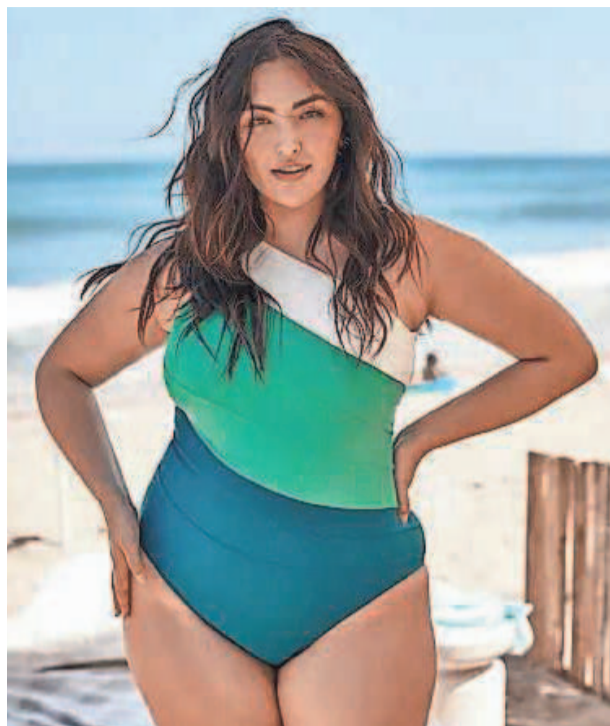
Summersalt is best known for its sleek one-shoulder tops and one-pieces (also known as maillots).