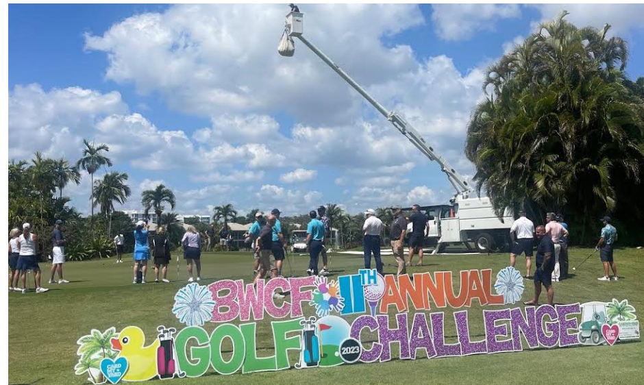
The Boca West Children's Foundation (BWCF) 11th Annual $100,000 Golf Challenge.

First place charity was Sweet Dream Makers and the Low Gross Winner was the